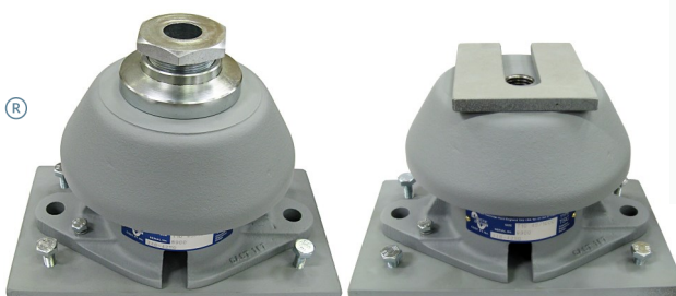
TSC T10 with optional height adjuster above and optional