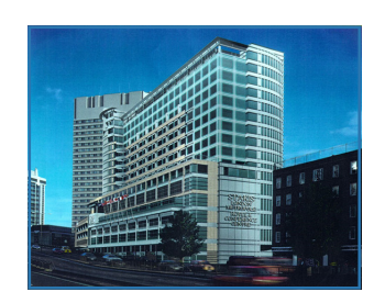
Internal & External Plantroom Floating Floors