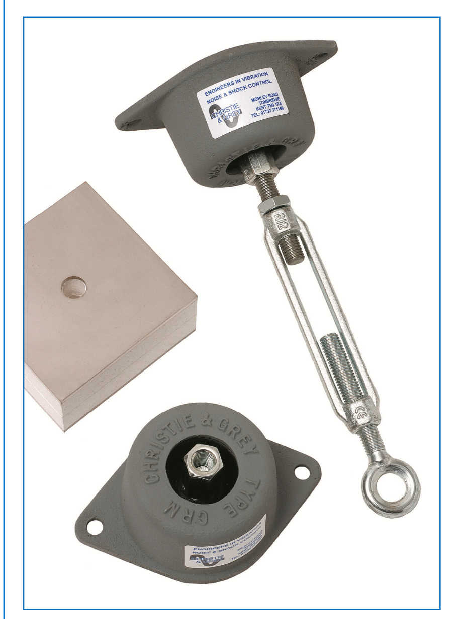
Image above shows 100 x 100 square Monolux a CRM2 Hanger with M12 turnbuckle/eyebolt and CRM2 Mounting with M12 fixings for the equipment.

A universal captive rubber mounting for supporting, hanging, anchoring and guiding pipework, particularly exhaust systems on board ship.